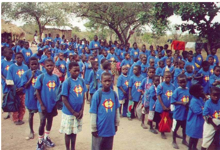
Children line-up before entering the school for classes